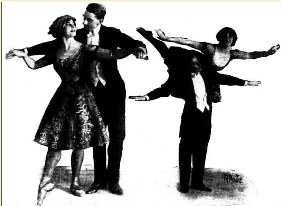
The commencement and the finale of the "Champagne de Danse." Mail (Adelaide) 25 May 1912, 12.

New Zealand's Wairarapa Daily Times reports in 1916 that Schilling performed her version of the dance at an Australian matinee in London. Her partner for the exhibition is unknown. 5