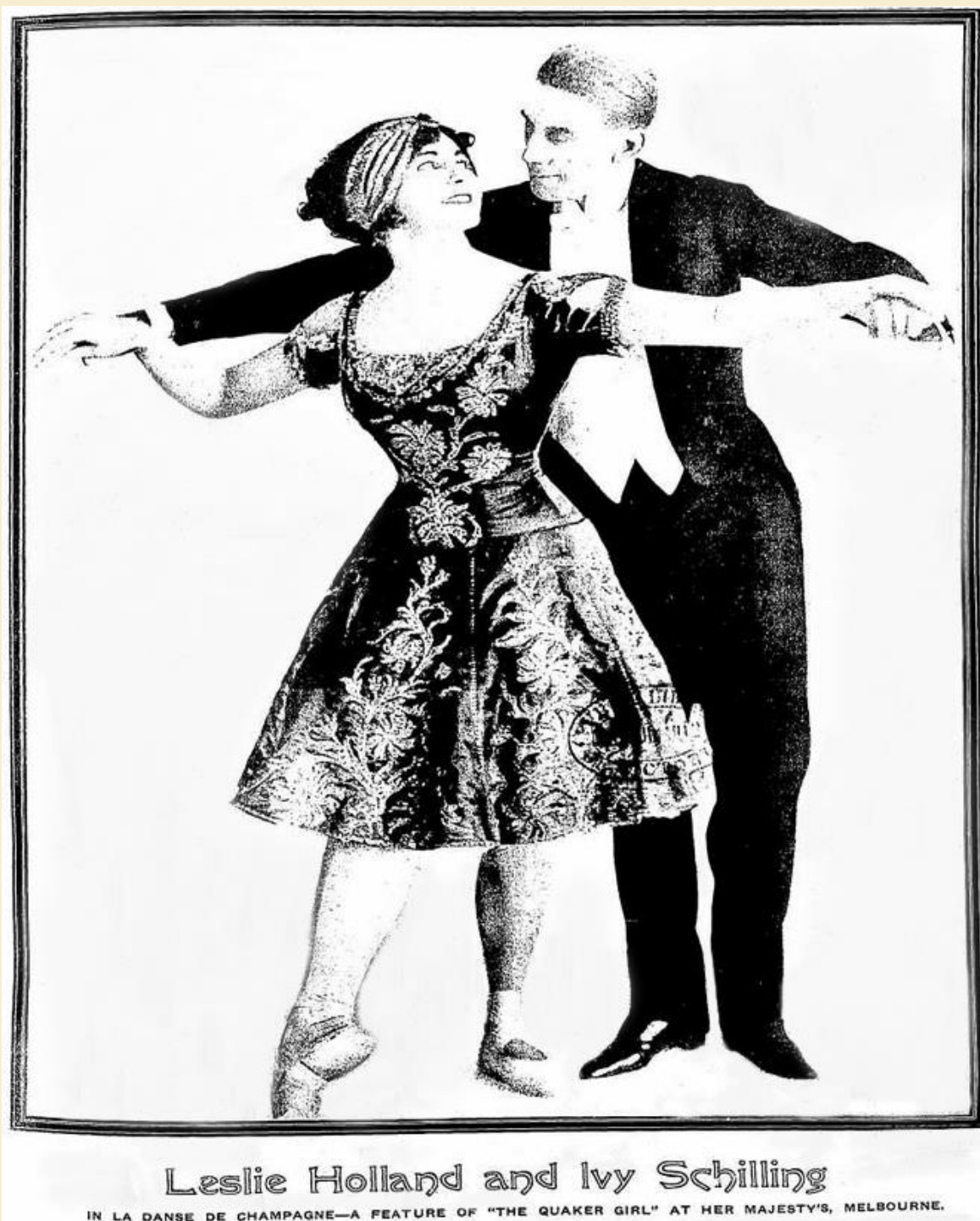
Table Talk (Melbourne) 18 July 1912, 19.

First published: 17/10/2015 • Last updated: 12/09/2022