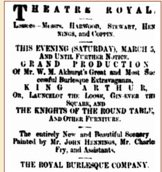
South Australian Register (Adelaide) 5 Mar. 1870, 1.