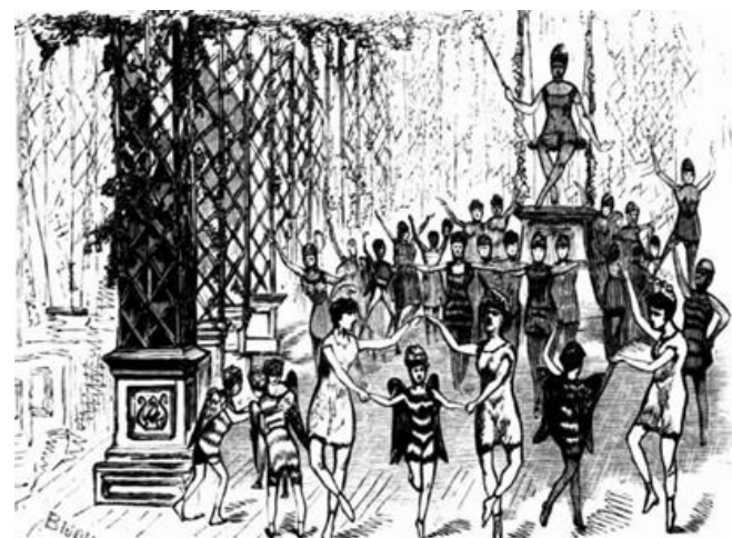
Gulliver; Or, Harlequin King Lilliput 14 Jan. 1882, 9.

First published: 28/09/2012 • Last updated: 29/04/2020