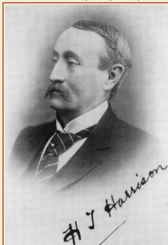
H.T. Harrison Turnbull Library, New Zealand