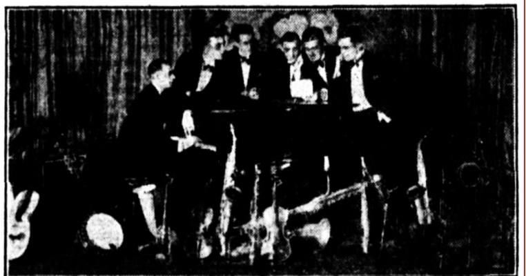
Daily Standard (Brisbane) 24 Dec. 1929, 4.