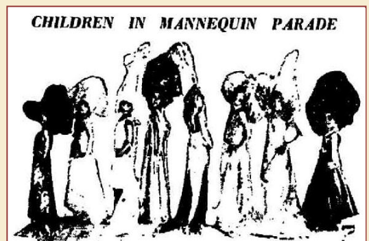
A unique feature of "Puss in Boots," at the St. James, is a mannequin parade by children.

tableau, a roof where a number of cats are dancing, overlooking a perspective of river, plain and high towers; the beautiful sylvan picture of the old mill with its broad wheel turning, and a rustic bridge leading to the deep glades beyond, the king's palace, an effective interior, and the rich transformation scene which concludes the first act, a spectacle of colour harmoniously blended in a scheme of blue bells, daffodils and roses" (" Puss in Boots ," 10).