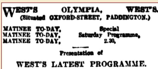
Sydney Morning Herald 9 Aug. 1913, 2.