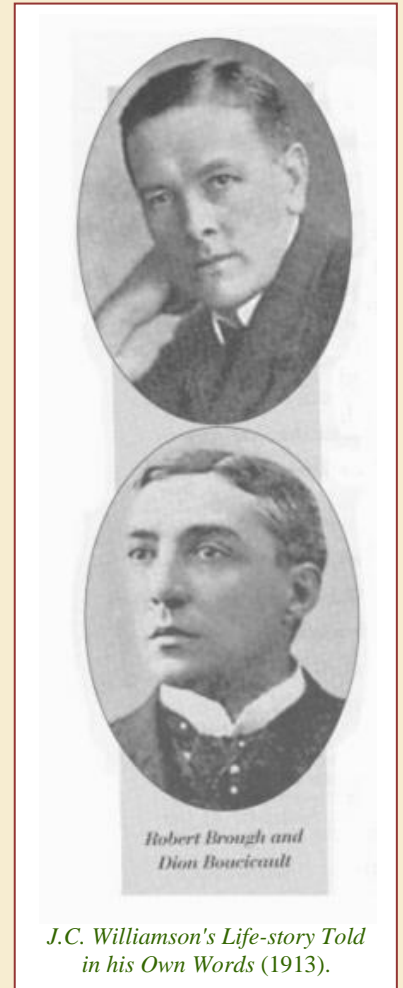
J.C. Williamson's Life-story Told in his Own Words (1913).