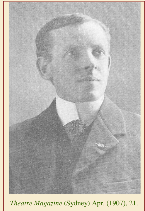
Theatre Magazine (Sydney) Apr. (1907), 21.