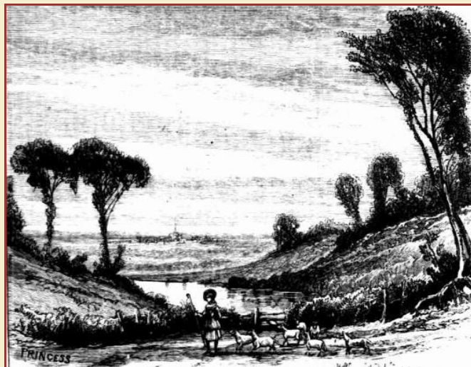
Dyk Whittingtonne and Hys Catte Australasian Sketcher 14 Jan. (1882), 9.

The pantomime contains a number of satirical references to Melbourne of the time, particularly unions and early closing. It also includes a burlesque of Bulwer Lytton's Richelieu .