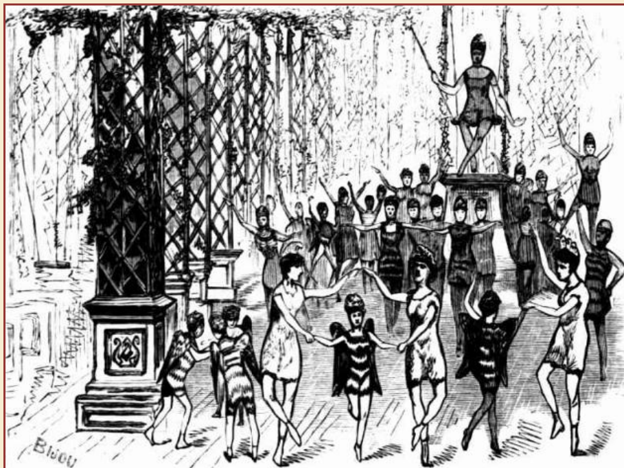
Gulliver; Or, Harlequin King Lilliput Australasian Sketcher 14 Jan. (1882), 9.