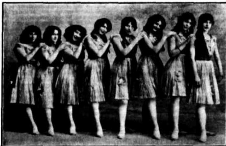
SOME OF THE BALLET.